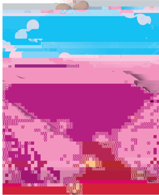
Figure 3 | Sketch of the orbital texture switch deduced from the experimental and theoretical matrix elements. a , The green orbitals are of p_z character and are viewed with p -polarized light. b