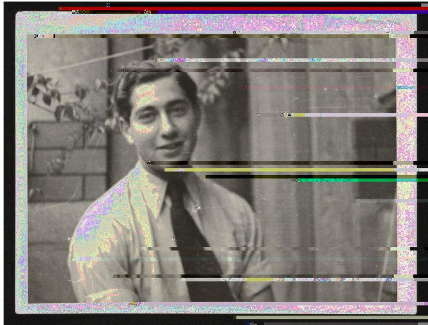
M5/-&#1^;#K#1''B''#3%(4(-2/3%#('4&4&2#1 /0#, #C&2)+, #32+(2#4(#%+. #5+-2/4+(, # 4(#E%/ , -%/+6# &#* /.# , +, &4&&, #/4#4%&#4+5&6