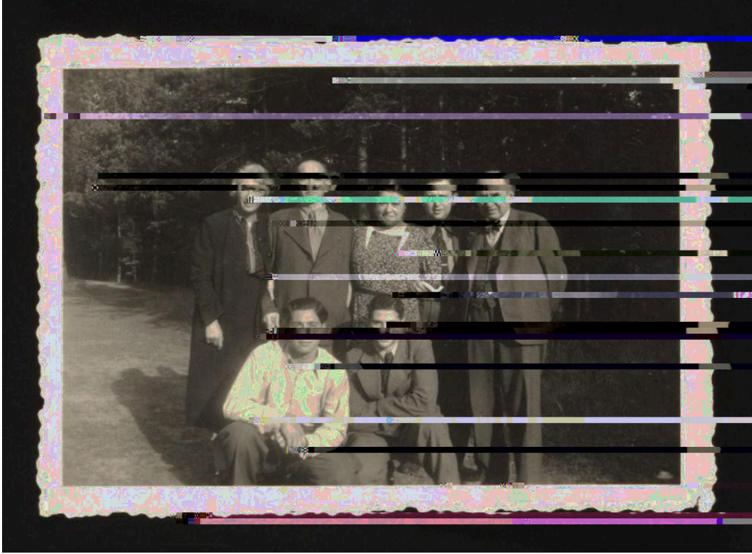
M5/-&#1;#K, #1+21/#1''B^.#3%(4(-2/3%#('4%&#e+14(2# /5+)H#*+4%#2&)/4+:.&.(2# 2+&, =. ;#J/2)#e+14(2#4(3# 2+-%4g9#P)./#e+14(2#4(3#)&'4g9#/, =#&4&2#1 /0#e+14(2#FD(44(5#)&'4g6