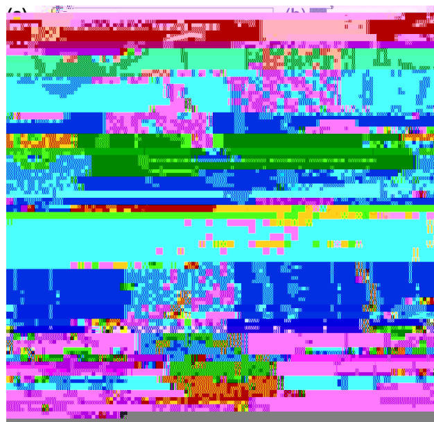
Fig. 6 Repulsive elastic force F_w and separation r vs. time t for a particle in a thick cell ( d \approx 60 \mu\text{m} ) anchored on two substrates. (a) Initial position of the particle close to the bottom substrate; (b) and (c) intermediate positions; (d) final position of the particle at the metastable level 2; (e) and (f) final position of the particle at the equilibrium sedimentation height. The plot shows the separation distance r (in \mu\text{m} ) as a function of time t (in \mu\text{s} ). The force F_w (in pN) is shown in the inset plot.

The onset of repulsive interactions between gourd-shaped particles and confining walls in thick cells (Fig. 5 and 6) is similar to that in thin cells. When released from the magnetic trap while close to substrates, colloidal particles repel quickly away from the walls (initial position 1), however, a separation between them increases non-monotonically (Fig. 5 and 6). Separation vs. time curves have a step which is even more pronounced than in thin cells; this is seen in the plots as a long plateau in the dependence up to the distance \sim 10 – 15 \mu\text{m} away from the walls (level 2), at which particles eventually come to the rest (Fig. 5a and 6a). What is surprising and interesting is that this metastable level is far below the equilibrium sedimentation height for particles in the thick cells (Fig. 1i). Particles can reside at this metastable level without moving up or down (depending on the bottom or top substrates) due to a local potential energy minimum arising from the interplay between gravitational and elastic forces of repulsion from both